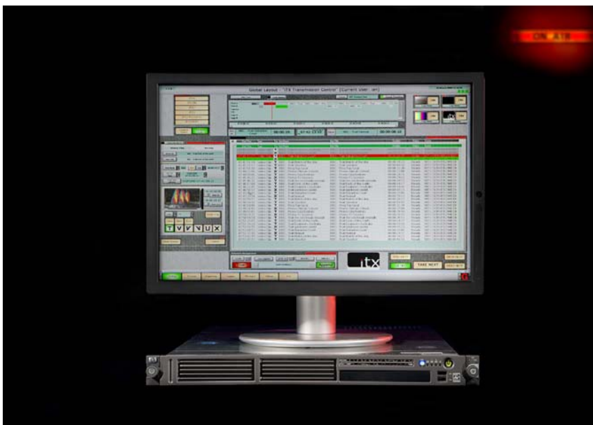
Figure 2. User interface at Microsoft Studios for the iTX system.

iTX controls are right where production teams need them: at their fingertips. iTX helps Microsoft Studios personnel to build program schedules and access and adjust programming using a single system, thereby allowing them to quickly preview and update